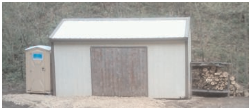
The new clubhouse shed is in place.