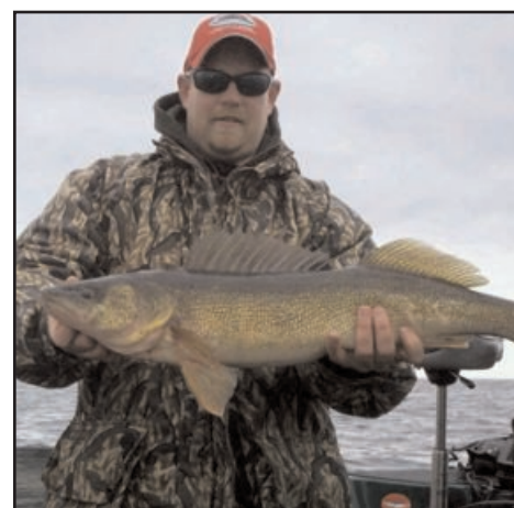
Big waters produce big fish

People in the fishing industry blame the poor weather conditions on the May 14th opener, high gas prices, and concerns about the state of the economy. More than 257,000 licenses had been sold by the Friday before the opener, down from the nearly 367,000 sold by the same time in 2010 and from the 12-year average of 364,000 on that date.