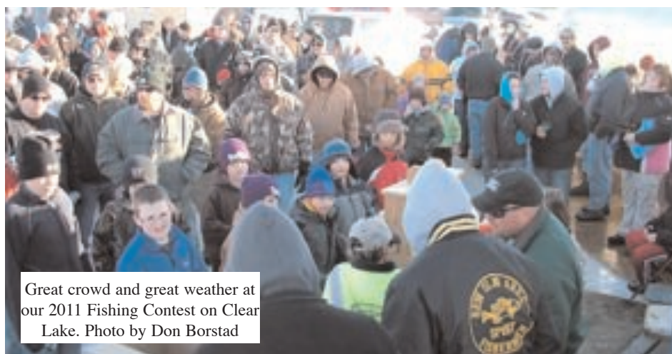
Great crowd and great weather at our 2011 Fishing Contest on Clear Lake.

On my very first job I said, thank you and please They made me scrub a parking lot down on my knees Then I got fired for being scared of bees And they only gave me fifty cents an hour.