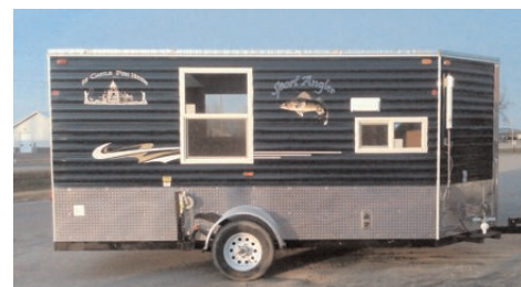
Fish House to be given away at the 25th Annual Contest at Clear Lake.

Minnesota 2011 Fishing Season Opener . . . . . Saturday, May 14th