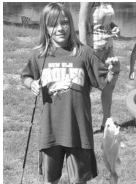
NUASF hosted the annual kids fishing contest on August 11th from 4-7 p.m. There were 124 kids signed up and 127 fish were caught.