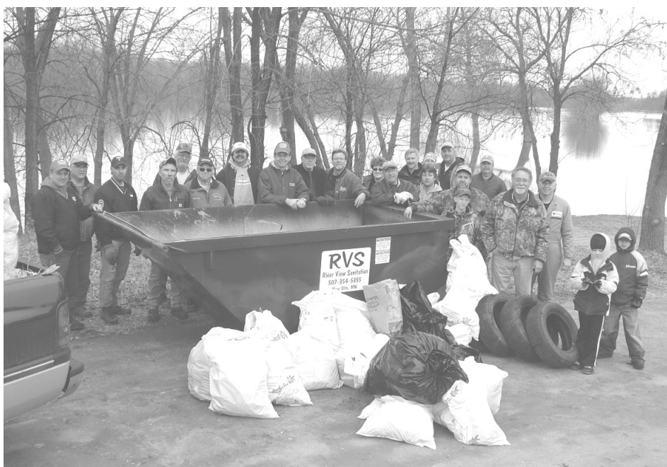
Minnesota River Cleanup crew.

A post from Scott Sparlin sheds light on the shimmering, glimmering waters and banks of the “forgotten” Minnesota River. The Community Clean Up for Water Quality Day, not including the some-200 green cards (totals to be released at a later date)—the numbers are, and have been, impressive. On April 4th, the pick-up netted 31 pounds of phosphorous from the gutters of New Ulm, which was prevented from entering the estuaries and tributaries of our watershed. Scott has figured that, according to standard sewage treatment plant statistics, it would cost $18,000 to remove such amounts of phosphorous from (or to keep it away from) the river. Also “netted,” were five tires (Royal Tire will take them) and half a dumpster of pure trash, which, sadly, will end up in a landfill overlooking the Cottonwood River.