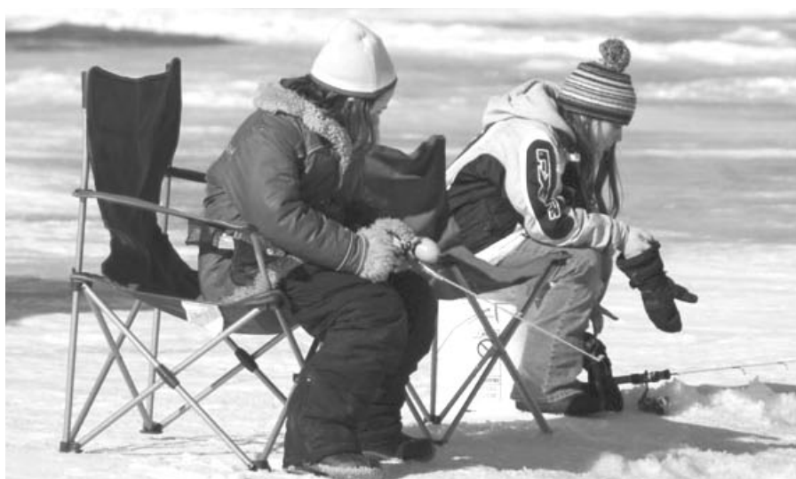
Girls fishing at Clear Lake.

Paul@conservationminnesota.org . Good questions always deserve good answers!