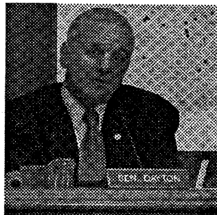
Senator Mark Dayton