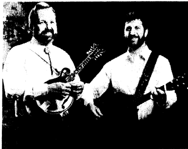
Kimmel, Rosenstein & Company

FOOD & REFRESHMENTS ★ ENTERTAINMENT ★ RIVER AWARENESS CONTESTS ★ DEMONSTRATIONS ★ DISPLAYS ★ ARTWORK ★ DOOR PRIZES