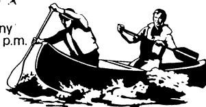
Sponsored By Alumacraft