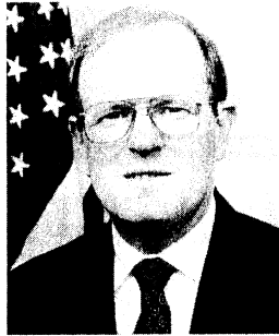
David Minge, U.S. Congress